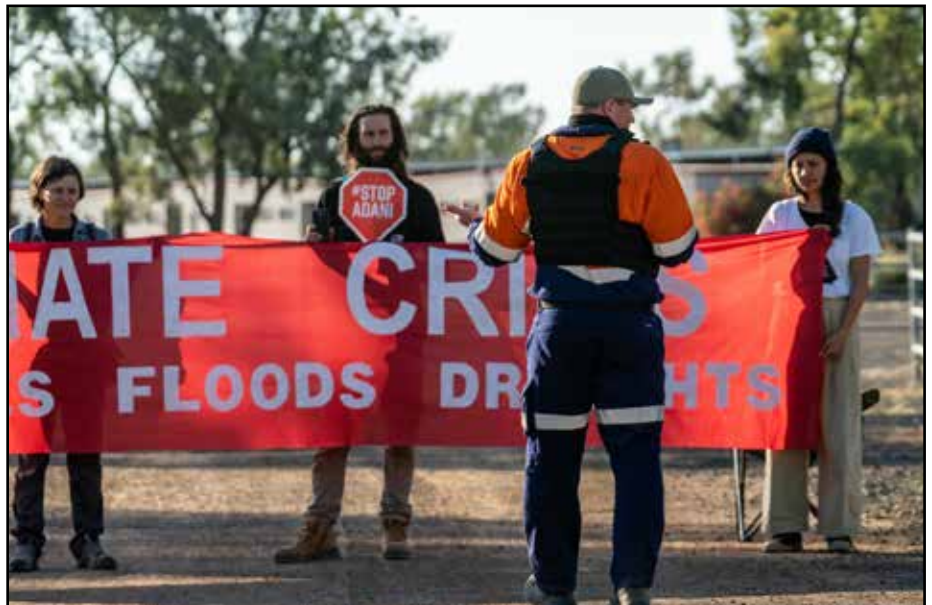
A group of 30 people disrupted work for four hours on September 18 at the site of Adani's Carmichael mine. The group blocked the gates of Adani's workers' camp, stopping workers from entering the proposed mine site. The group declared that with Prime Minister Scott Morrison set to snub the United Nations Climate Action Summit next week, there is an urgent need for everyday people to take action and stop the construction of new coal mines.