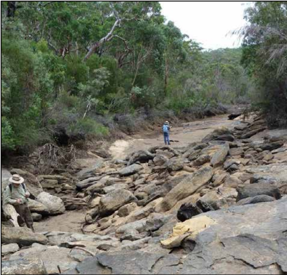
A creek drained of water by the underlying Dendrobium Mine.

“Their underlying sandstone is cracked and the swamps have dried out.”