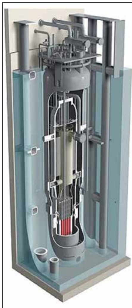
Nuclear dreaming – a design for a small modular reactor proposed by NuScale.