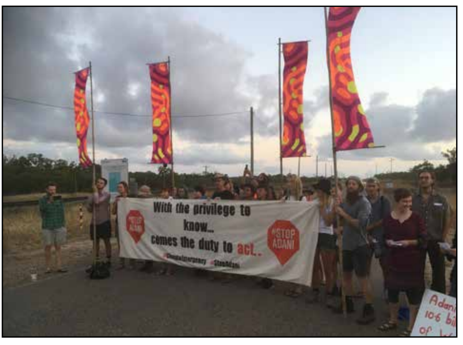
A blockade of the Abbott Point Coal Terminal at Bowen, North Queensland at dawn on October 1. A group from the Frontline Action of Coal camp supported two other people (not pictured) who were on the coal rail with their arms locked in a barrel of concrete.