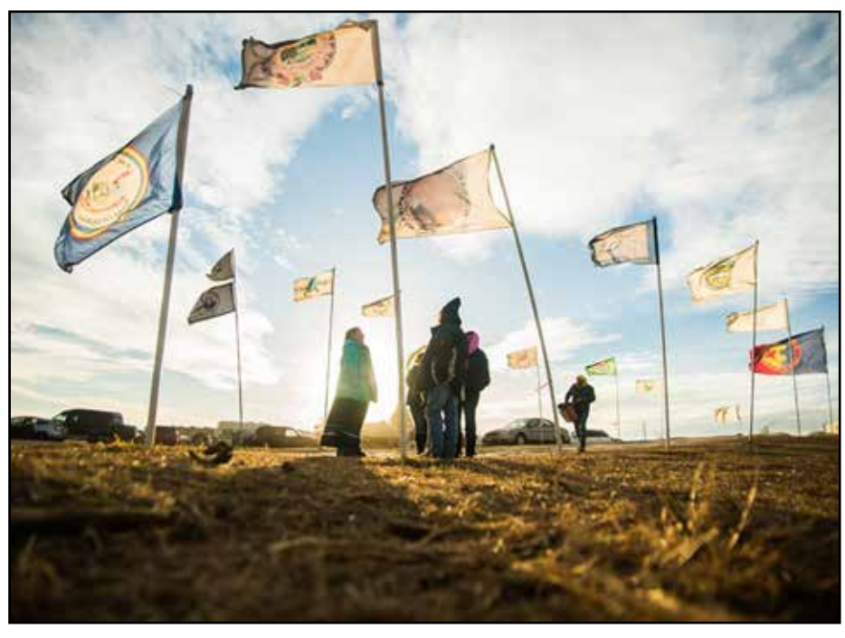
Flags fly at the Oceti Sakowin Camp in 2016, near Cannonball, North Dakota.

DAPL and the fight against the pipeline was the subject of international attention in 2016 when thousands of water defenders gathered at camps in North Dakota, facing a highly militarised police force armed with tanks,