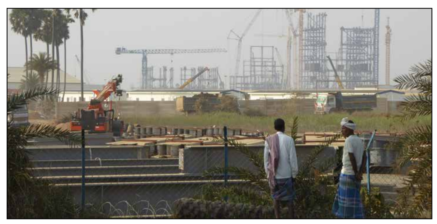
Indian traditional farmers looking at Adani's Godda power plant, being built to burn Australian coal.

Click on the links to view original articles. (Subscriptions may be required)