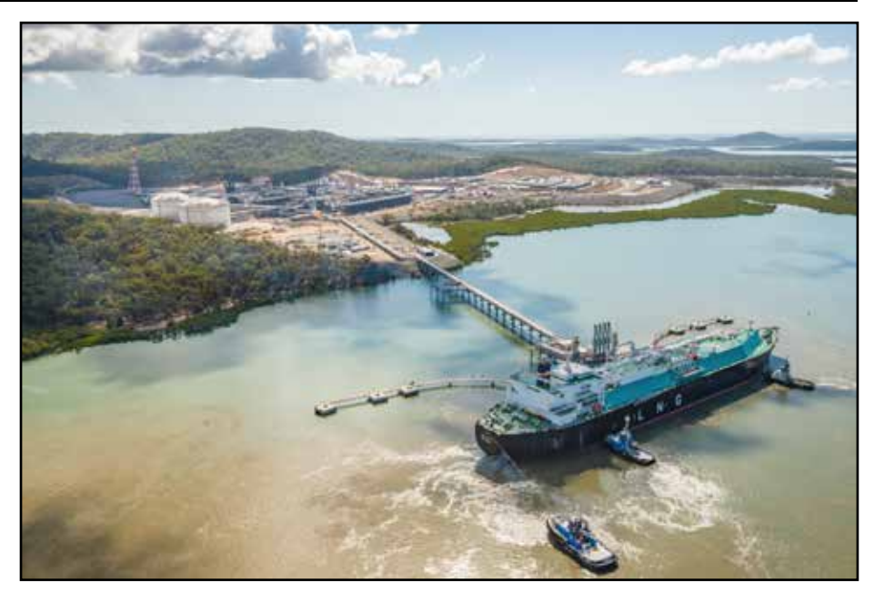
Papua New Guinea's LNG terminal ships the country's gas overseas while traditional owners say royalties have not been paid.

Papua New Guinea's Prime Minister Peter O'Neill has rejected as "utter nonsense" a report — he later admitted he hadn't read — that claims his