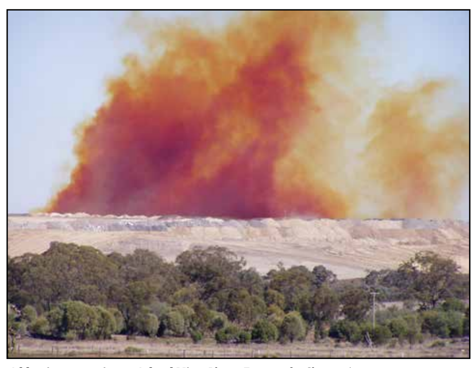
A blasting operation at Acland Mine.

said Supreme Court Justice Bowskill rejected 32 of the 35 objections raised by the mine proponent, returning only three to the Land Court for further consideration.