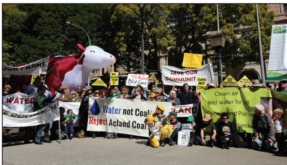
Acland farmers and supporters protested against the Acland Stage 3 expansion last year in Brisbane.