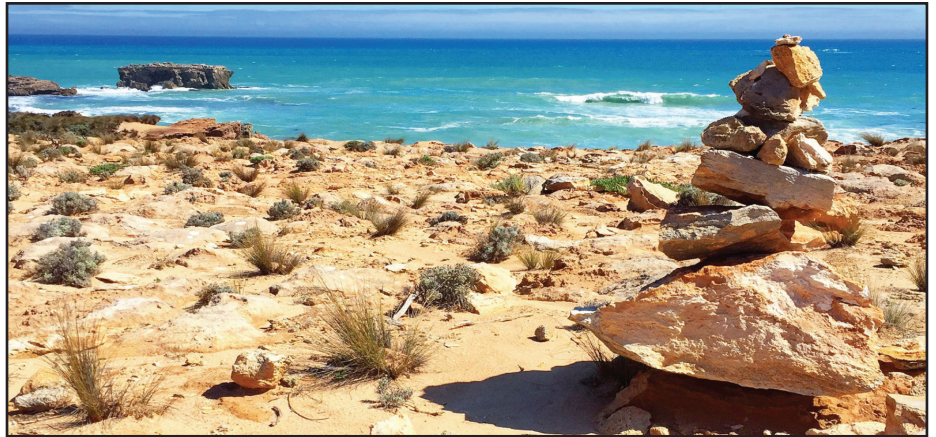
The Limestone Coast, SA, needs protection from gas exploration.

There are brave young people in Adani's proposed mining country coming from all over Australia to lock on to rail and mining equipment, in the summer heat. They aim to slow down the construction of the rail line proposed to cart off Australian coal to India.