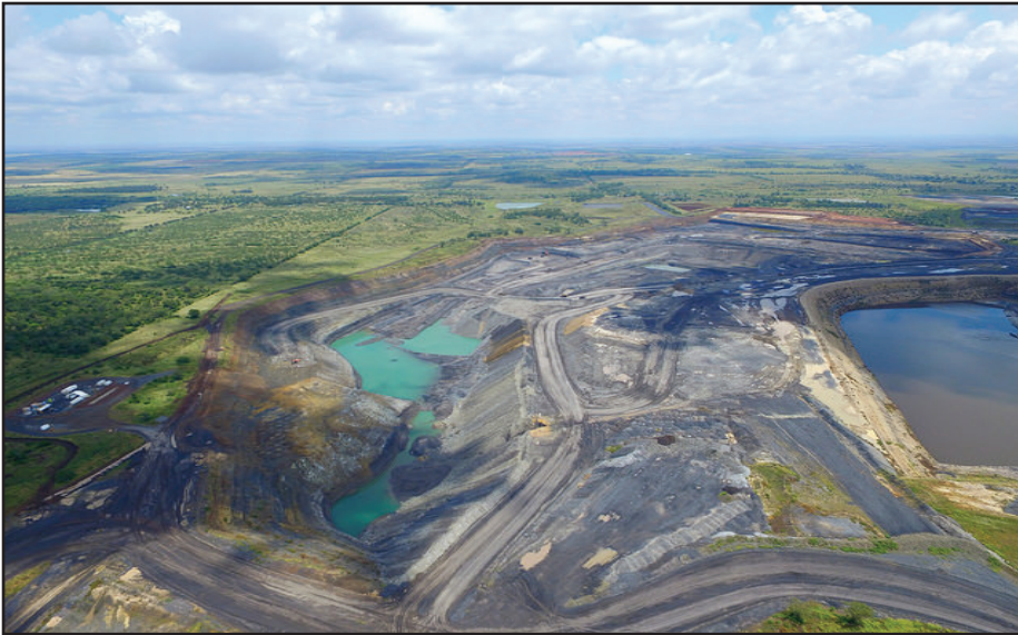
Acland coal mine, Darling Downs, Qld.

https://www.theaustralian.com.au/business/mining-energy/new-acland-mine-expansion-blocked/news-story/597585e4f9415e8c661e7bc86b560192