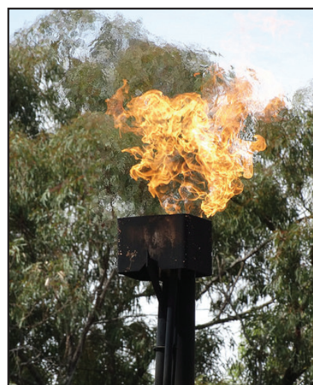
A coal seam gas flare on the Darling Downs.

"Despite this, DEHP determined that they found no cause to expand monitoring, thereby blocking Queensland Health's recommendation that overall gasfield emissions and the exposure of the community to those emissions be monitored. The rejection by the regu-