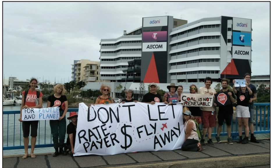
Protesters condemn Townsville Council’s airport gamble.