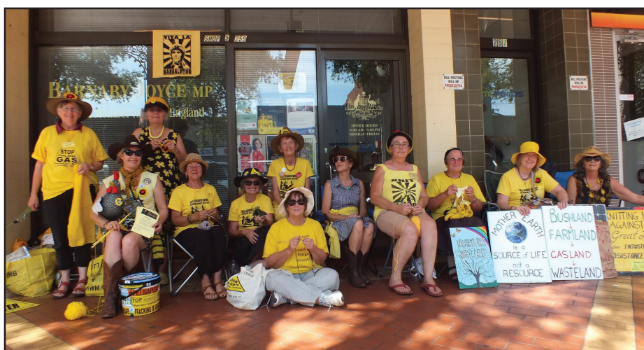
Knitting Nannas outside LNP MP Barnaby Joyce's Tamworth office.