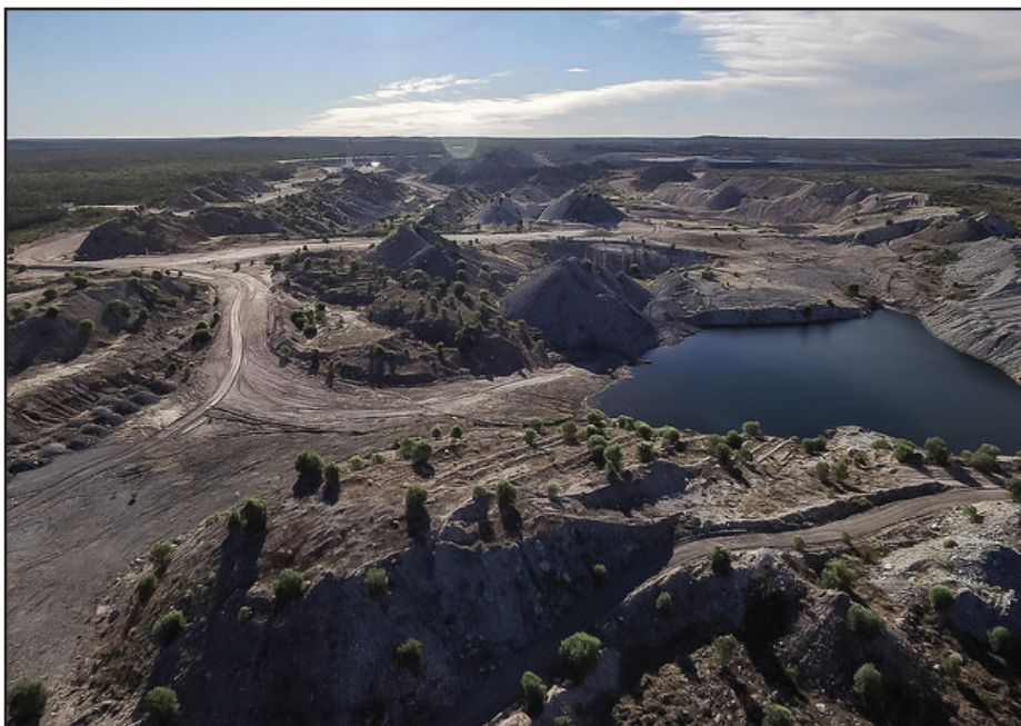
Blair Athol coal mine, 2016.

http://www.abc.net.au/news/2018-01-24/blair-athol-company-given-millions-in-surplus-enviro-funding/9353802