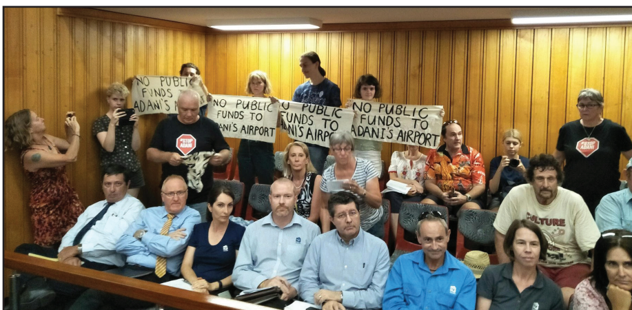
Protesters shut down Townsville Council meeting.

Supt McNab said police had charged protesters who had broken the law but