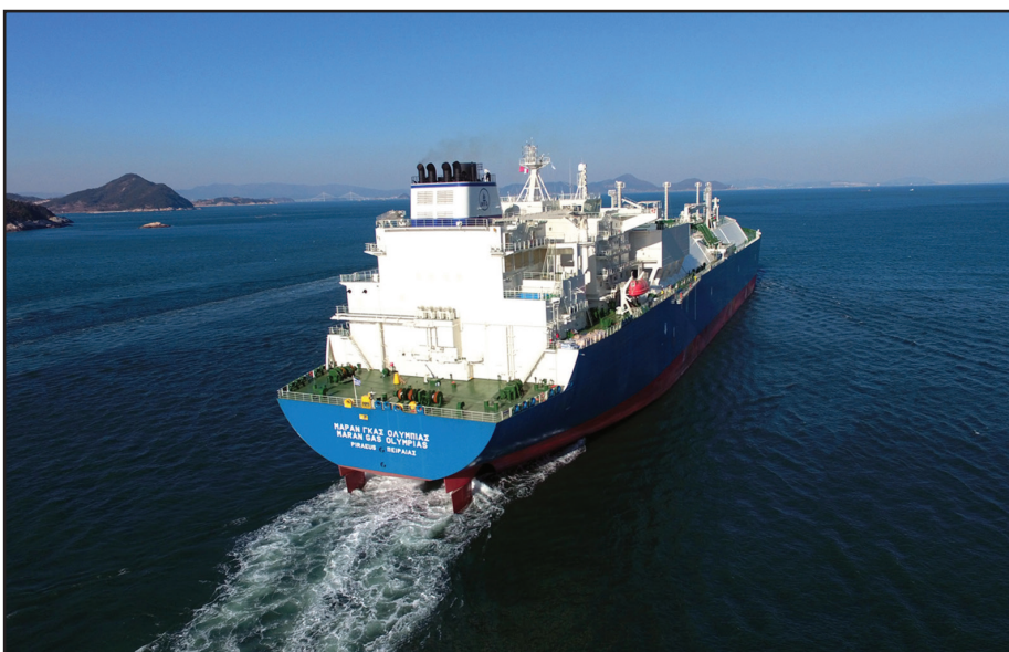
LNG tanker Maran Gas Olympias departed Gladstone on the weekend with a load of LNG for Zhejiang, a voyage of about 10 days.

One of Australia's top legacy mines researchers has questioned the scientific accuracy of some of the Northern Territory fracking inquiry's key environmental findings.