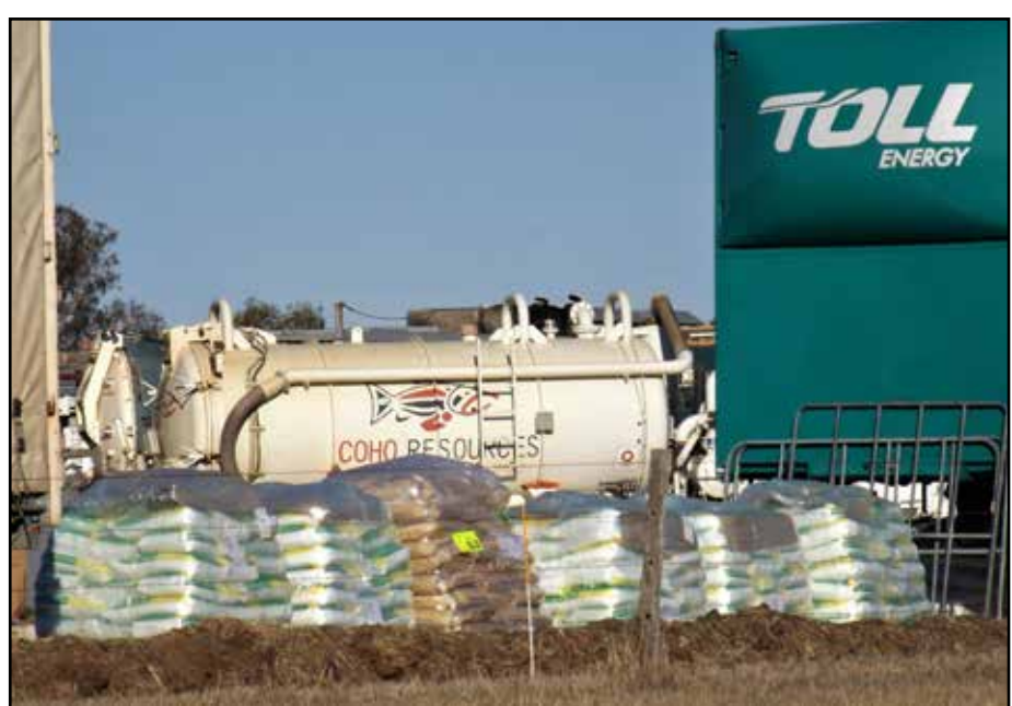
TOP: the drilling site on the corner of Tara-Chinchilla Road and Avenue Road operates 24/7 with noise and light pollution.

ABOVE: Bags of chemicals near the local school bus stop.