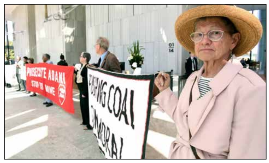
Senior citizens sent Queensland government HQ into lockdown, demanding Adani be prosecuted for breaching a pollution licence.

Adani has been fighting separate allegations for the past four years that it used a shell company in Dubai to siphon hundreds of millions of dollars