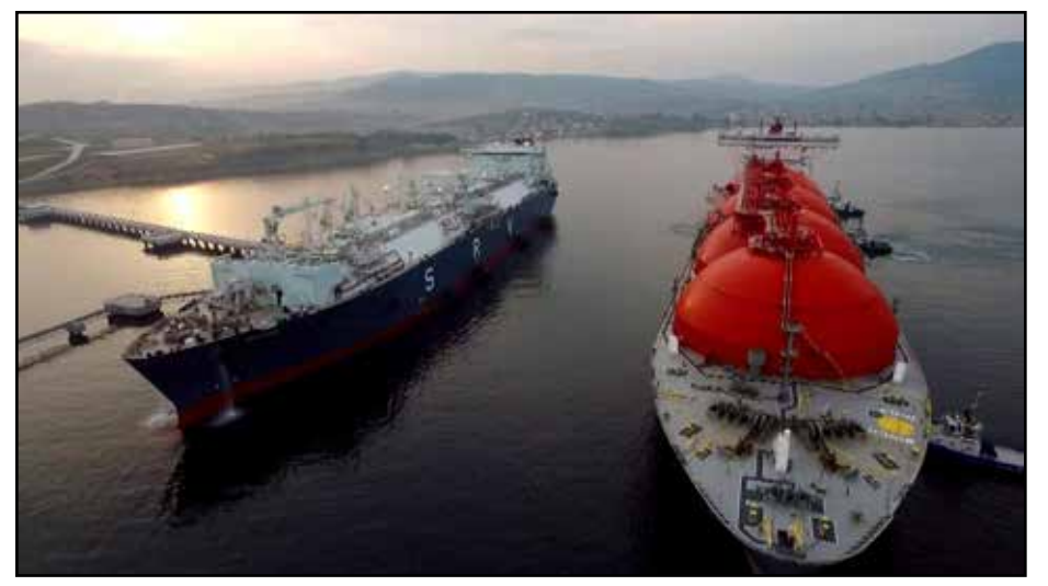
An LNG tanker nudging up to a floating storage and regasification unit. Residents of Crib Point and the peaceful Westernport area don't want to see this in their bay and adjacent Ramsar-listed wetland.

Environment and Westernport-based community groups say AGL's proposed massive gas import plant at Crib Point near Hastings requires a full Environmental Effects Statement (EES).