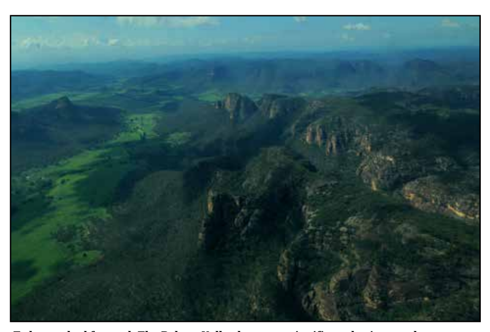
To be trashed for coal: The Bylong Valley has state significant heritage values.

"The recommendation to proceed with the Bylong mine shows the NSW Government is completely missing in action on climate change just as