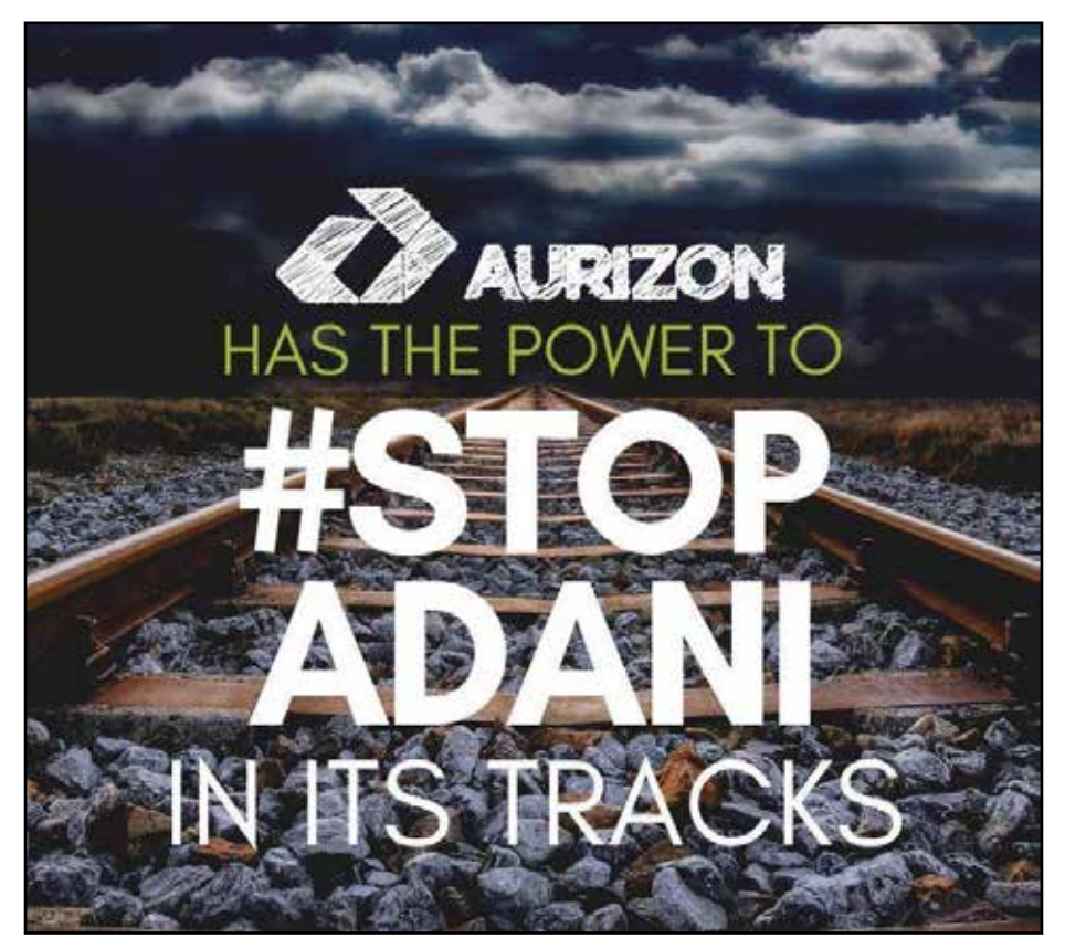
Aurizon is now in the sights of anti-Adani activists.