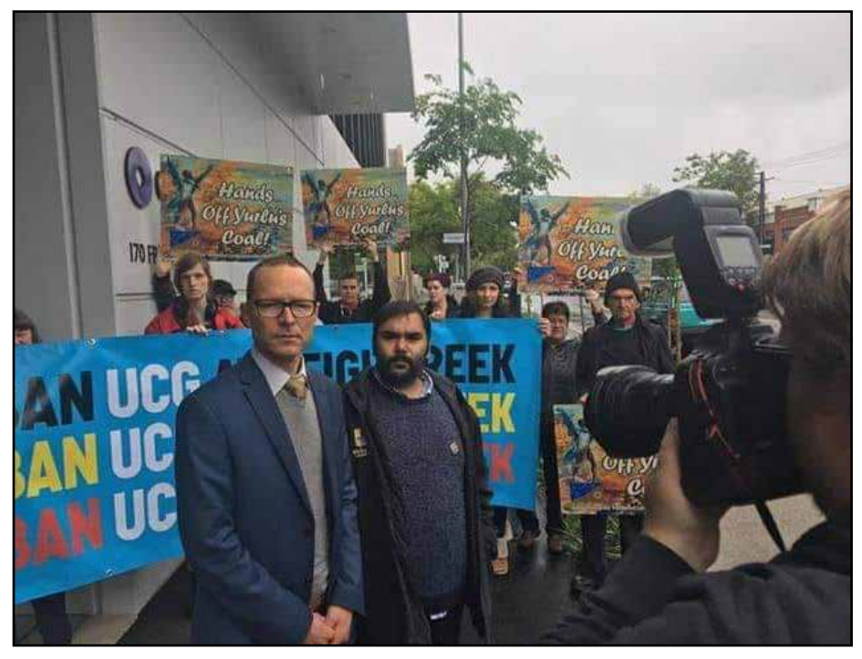
Adnyamathanha Traditional Lands Association and supporters protest outside Leigh Creek Energy's AGM in Adelaide last week.

against this toxic project, and stand up for the community in Leigh Creek, and the traditional owners who want this project stopped."