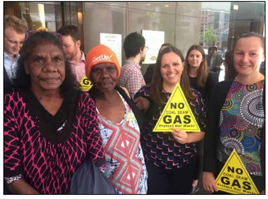
Traditional Owners from the NT outside Origin's AGM.

"It will poison the land, it will impact the local bush food. The fracking will make your kids sick. We are thinking about the future generation of our young children."