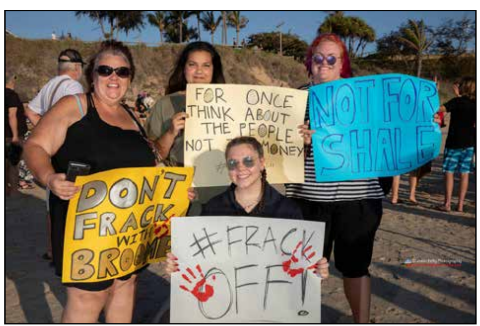
Protesters in Broome express their feeling as WA Premier, Mark McGowan, announced five million hectares of the state would be opened for fracking.

"In Queensland, there was a loss of 1.8 agricultural jobs for every new gas job created in rural areas. Gas jobs come at the cost of displacement of jobs in other industries.