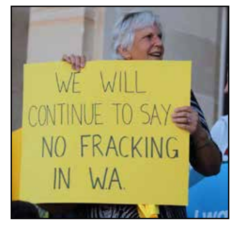
The WA government is given notice of continuing opposition to fracking.

"The fracking inquiry was based on extremely limited Terms of Reference