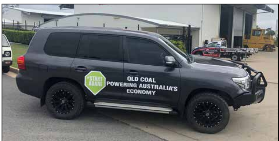
An Adani-aligned group with a Facebook page – Don't Go Cold on Coal – and advertising material including corflute signs and cars with logos – is making appearances at Stop Adani Convoy events in Queensland.