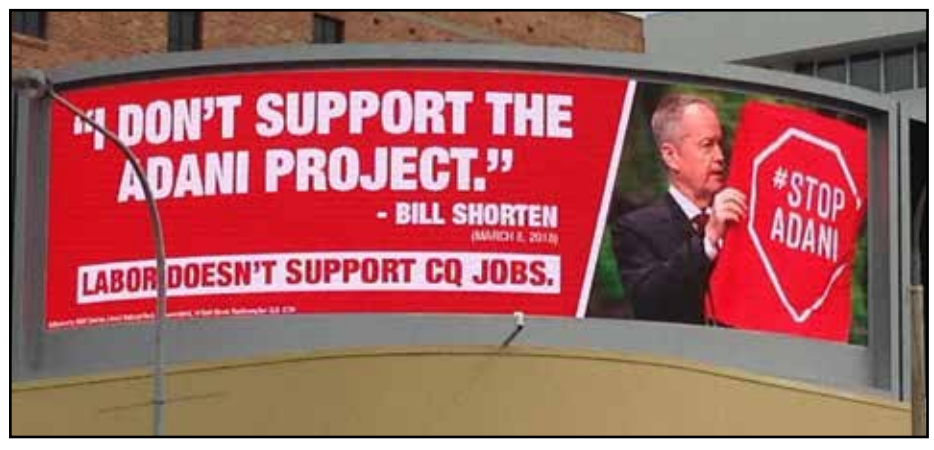
A Coalition billboard which uses a misleadingly cropped photo of Bill Shorten attempting to move away a protester's sign.

Citi finds that assuming a $40 emissions price, the ASX-listed stocks most affected by Labor's carbon plan by 2030, proportional to their cost base, are the utilities, Santos, Incitec Pivot, Woodside, gas pipeline owner APA Group and underground gold miner Northern Star. In each case the cost