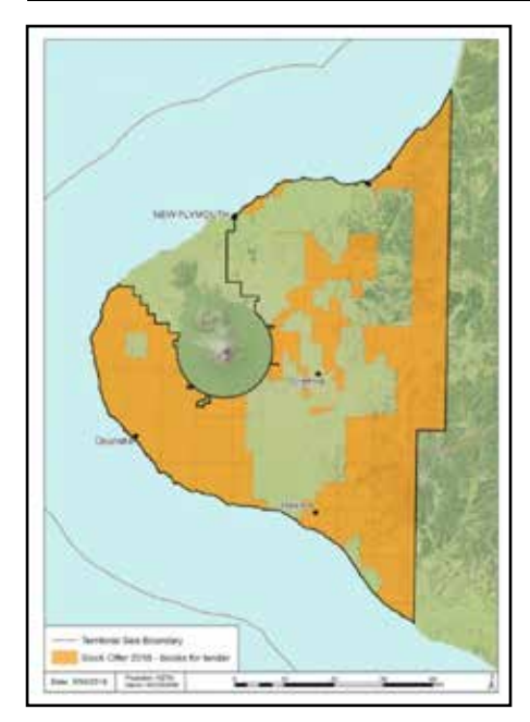
Oil and gas blocks up for tender in Taranaki, NZ.