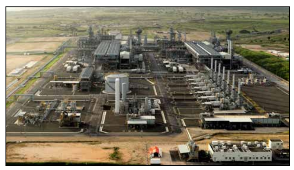
The PNG LNG site north of Port Moresby.

"Well it seems crazy a country like Australia, with so much hydrocarbon, is in a situation where we've got boats going out of Gladstone loaded up with LNG and they're passing boats coming into Australia loaded up with LNG to meet our domestic market requirements," he said.