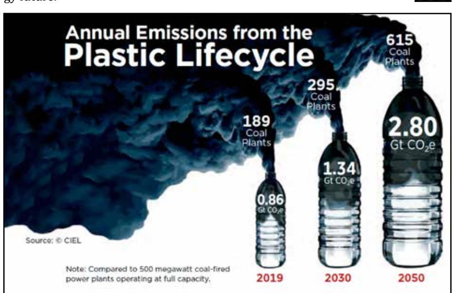
Annual greenhouse gas emissions for the plastics industry. See report p5.