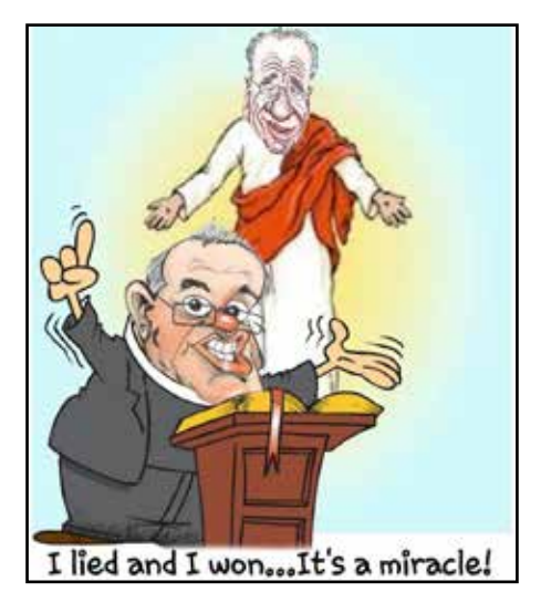
A cartoon doing the rounds on Facebook.

"There is little doubt that his government will do precisely that.