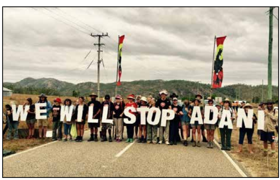
People from all over the country are making their way to central Queensland, where many are prepared to physically stand in the way of machinery in what has been described as the fight of a generation..

Polls have shown the majority of Australians are opposed to the mine, but billionaire miners Clive Palmer and Gina Rinehart have poured millions of dollars into advertising, political donations and right-wing think tanks