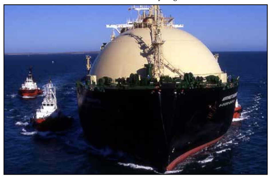
Liquid Natural Gas (LNG) import terminals could mean LNG tankers pass each other as they export, then import, gas to eastern Australia.

The Australian National Outlook models a future where demand for coal declines steadily through to 2060. It says that hydrogen can become a commer-