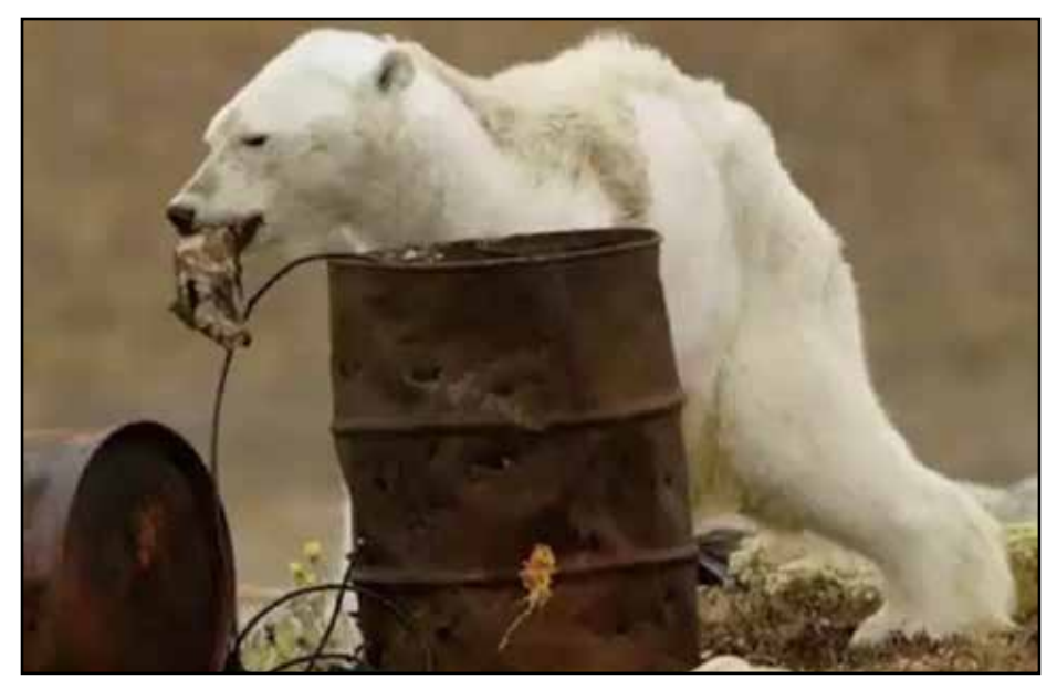
Climate change in Arctic regions has lead to famished polar bears scavenging rubbish around human settlements.

While large emissions reductions are key to avoiding smashing temperature