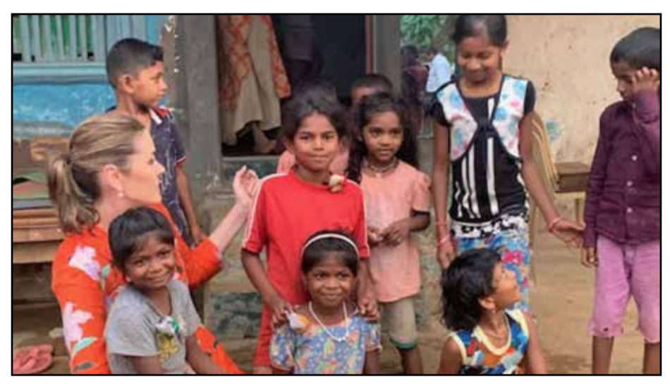
Right-wing commentator Peta Credlin visited India courtesy of Adani and met villagers recently connected to electricity. The woman she interviewed could only afford a couple of light bulbs and was still cooking on a wood fire. Credlin missed the point here – Indians go without power due to poverty, not lack of coal, and Adani is not going to forgo profits to supply electricity to people who can't pay. Renewables are now cheaper than coal in India.