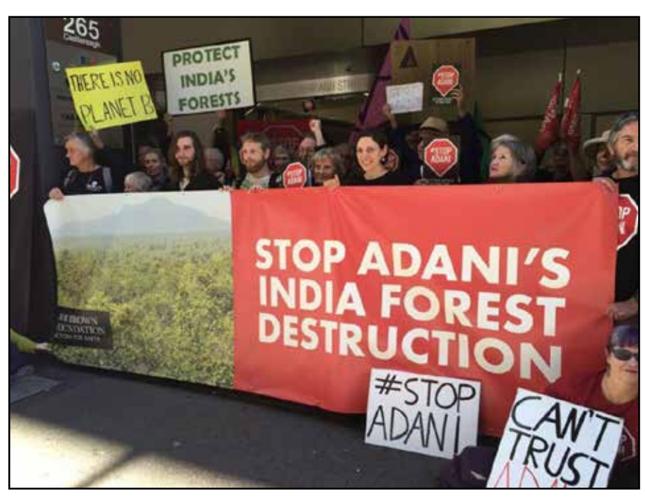
In a taste of things to come, 200 protesters gathered on Saturday (June 15) outside the Indian High Commission in Canberra, with several dozen campaigning near the Indian consulate in Sydney (pictured). The target was not only Adani's Carmichael mine in central Queensland but the Indian company's destruction of Hasdeo Arand forests in central India.

Exhibit A: the decision this week by the Queensland State government to allow a big coal mine in northeastern Australia to move forward. The project,