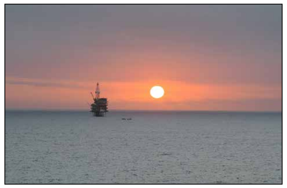
ABOVE: Equinor's Peregrino B platform.

BELOW: The Stromlo-1 exploration drilling program location. Map: Equinor