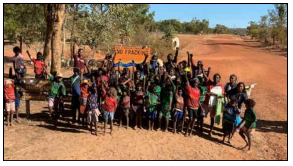
Minyerri residents protests about fracking and declare their land a 'no go zone'.