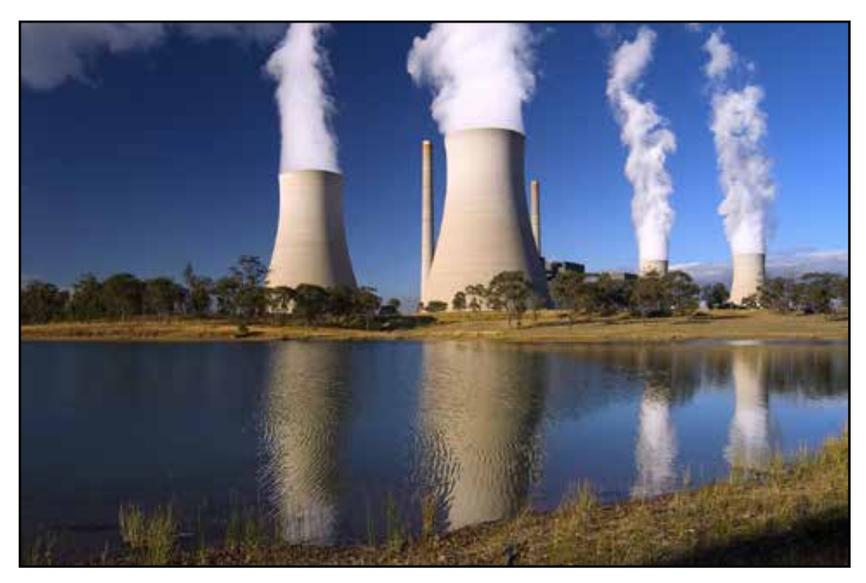
AGL's Liddell power station is one of the nation's most unreliable, with 11 breakdowns in 2018. It is scheduled for closure in 2022.

"Last summer, solar significantly reduced and delayed the levels of peak demand by many hours, which is crucial in avoiding electricity shortfalls and keeping prices down.