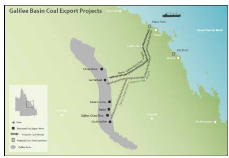
Galilee Basin coal export projects. Map: galileebasin.org

While global coal plant capacity has risen over the last decade, the less well documented half of the story is that global coal plant utilisation has