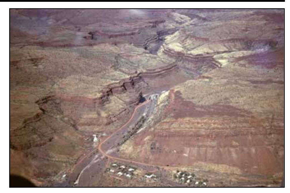
Wittenoom (above) is contaminated with mountains of deadly blue asbestos tailings.

Aeris Resources and Argonaut Resources are searching for deposits of