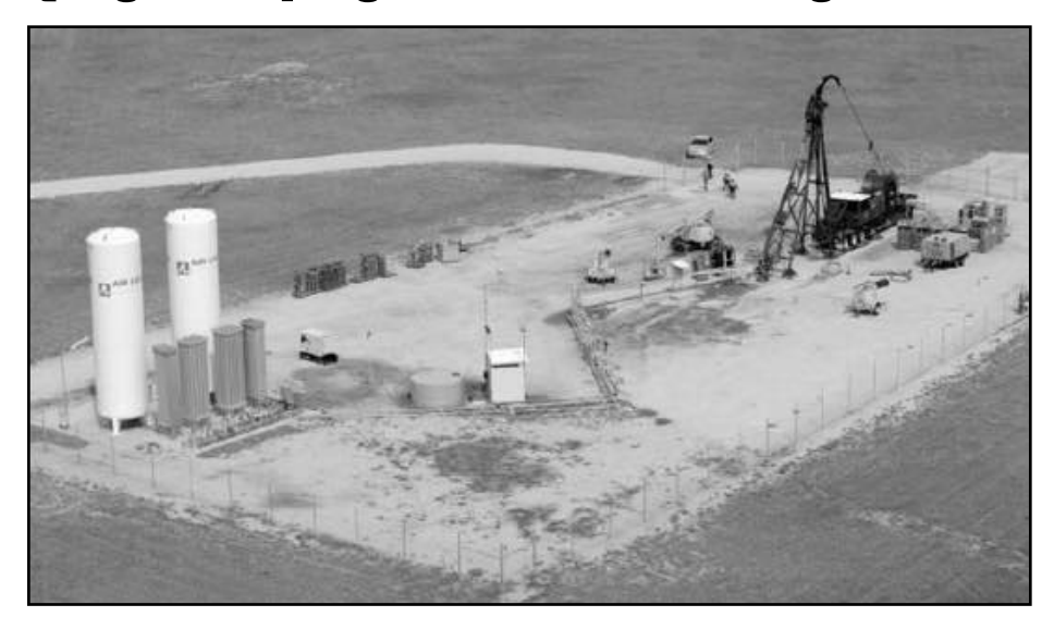
Linc's toxic UCG experiment was once valued at $1 billion. The costs of rehabilitation is currently estimated at $78 million over 30 years – to be financed by taxpayers.

The Queensland government has called for expressions of interest for plug and abandonment services at the ex-Linc Energy underground coal gasification (UCG) site near Chinchilla.