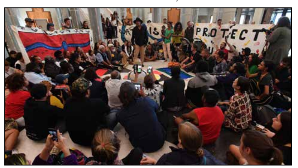
Aboriginal and Torres Strait Islanders protesting in the Marble Foyer, Parliament House, Canberra, on Thursday.

"We are hurting in the face of water shortages, extreme heat, environmental pollution and the destruction of country and culture."