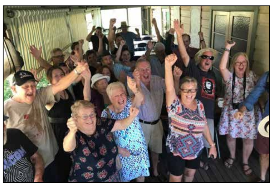
Opponents of the Rocky Creek coal mine celebrate their court win. The NSW Minerals Council describes them as 'urban greenies', despite them mostly being Gloucester locals.