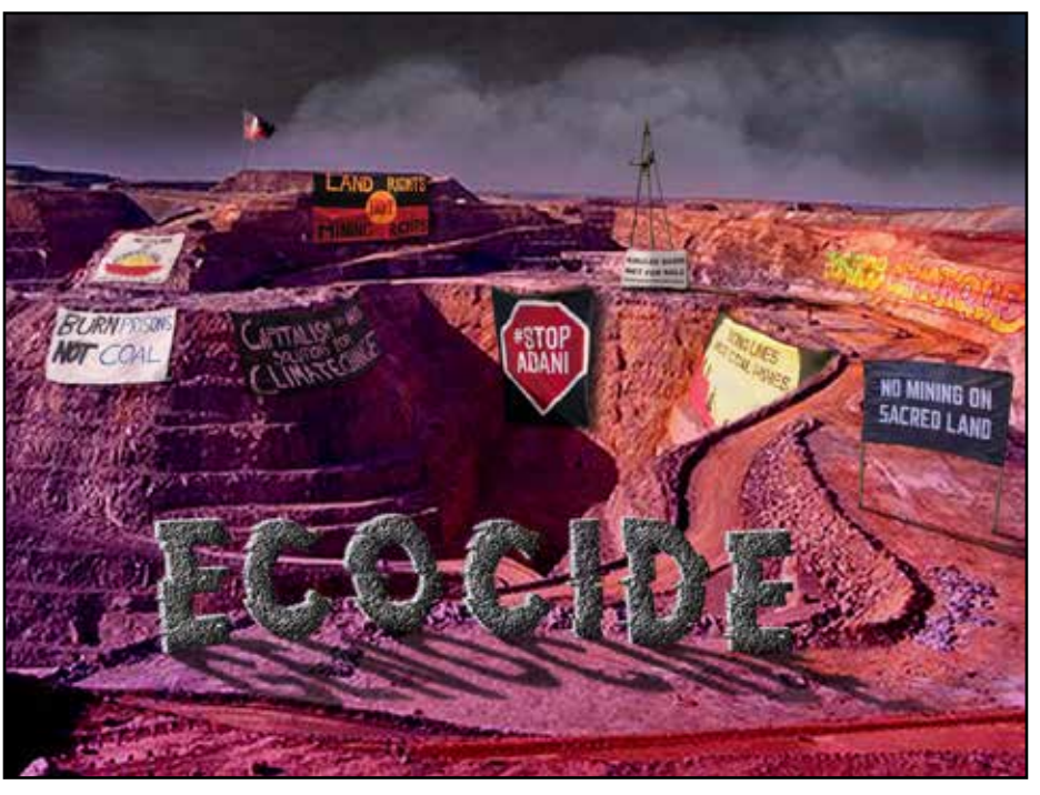
Meme from Post-romantic queerwave, Facebook.