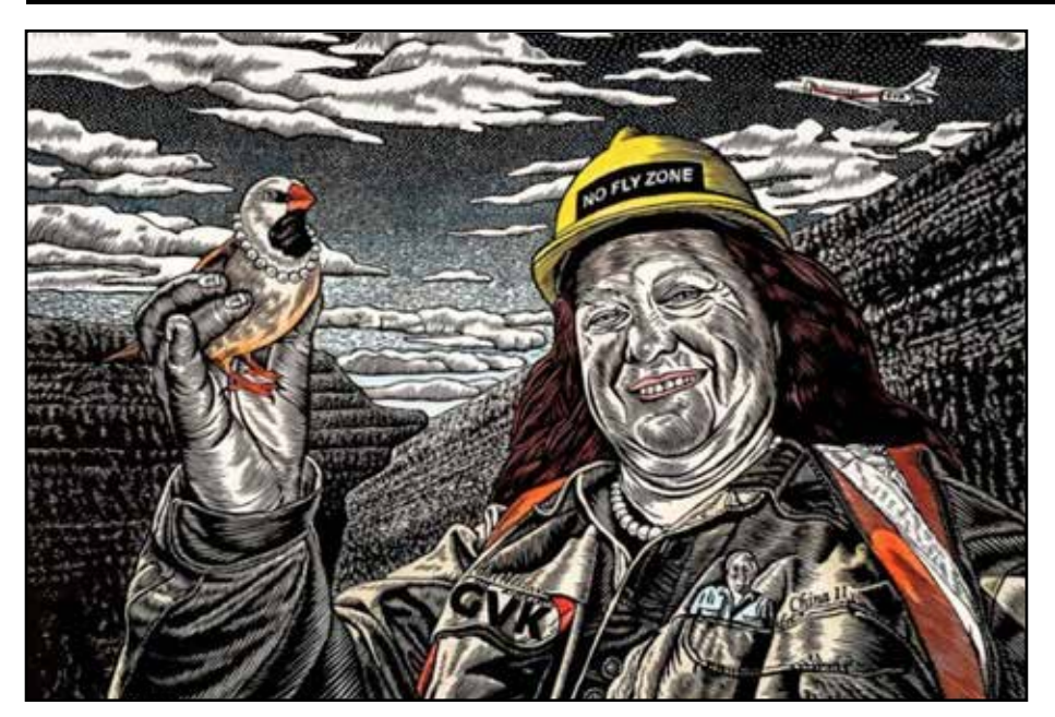
The Coal Throated Finch, by Rew Hanks, is one of the exhibits at Bimblebox 153 Birds. Picture: Rew Hanks