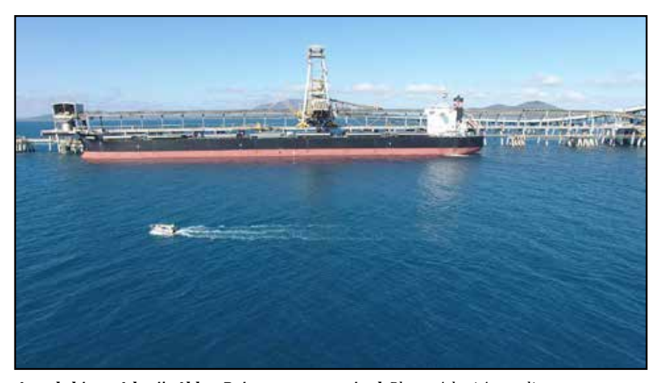
A coal ship at Adani's Abbot Point export terminal.

Aurizon lodged a statement of claim in the Queensland supreme court in January against the group Frontline Action on Coal (Flac) Incorporated, seeking "user-rent" from the organisation as damages for five separate protests in December and January that blocked the rail line. ... Ahead of the hearing