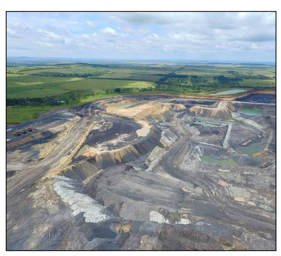
The Acland coal mine is devouring prime agricultural land.

Key facts in relation to Acland Stage 3 established by the original Land Court decision that have not been challenged include that: