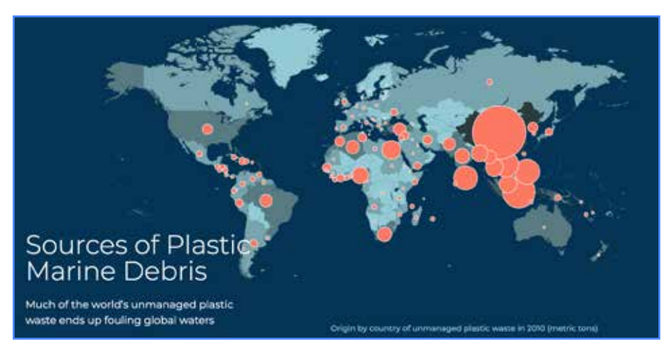
Origin by country of unmanaged plastic waste in 2010 - metric tons.

"But unfortunately, this initiative does not tackle the problem at its source: