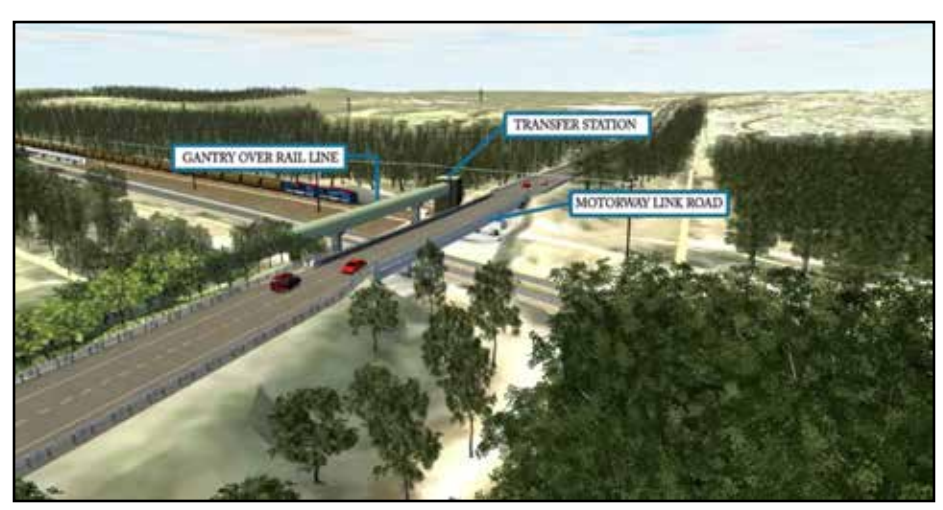
A mock-up of part of the railway associated with the Wallarah 2 coal mine on NSW's Central Coast.

It also acknowledged that "economic costs and benefits of the project are