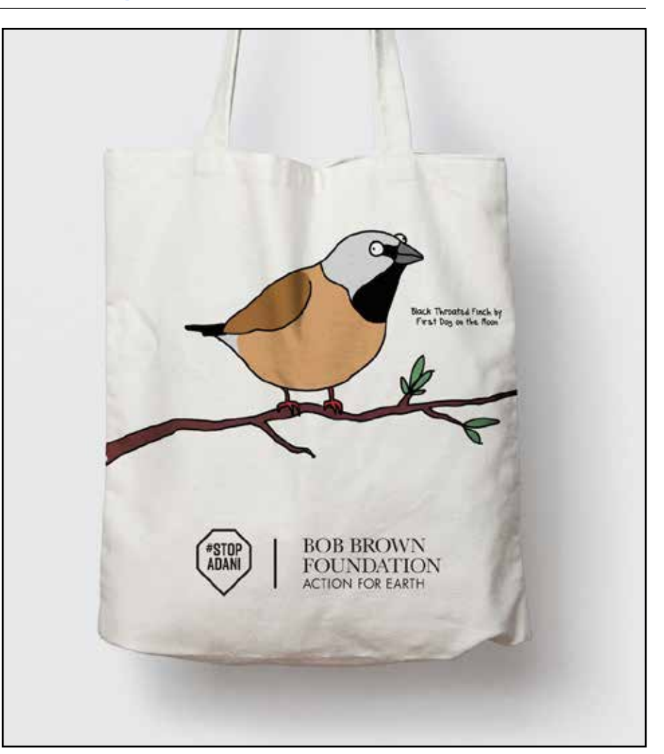
The Bob Brown Foundation says, "We have just put a few of these Black-throated Finch tote bags up on our online store. Printed in Australia on 100% organic cotton.

Article says $500,000 is sought to set up a base for the campaign at Binbee to train activists and plan protests.