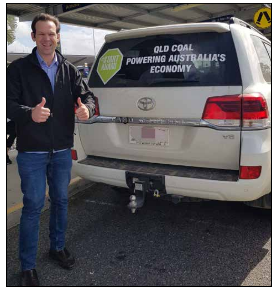
Coal minister Matt Canavan says he wants this car, seen in Rockhampton.

The promise the mining companies and the Barnett government made when the boom took off way back in 2008 was that it would lift the state while dragging it into the future. The