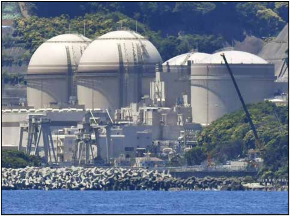
A Japanese nuclear power plant. An Electrical Trades Union spokesman doubts that many Australian communities would accept the 150 nuclear power plants suggested for Australia in an Industry Super Australia report.

Article quotes ETU national secretary Allen Hicks saying industry fund participants were not consulted on the ISA energy paper released last week and called on unions to condemn the paper's recommendations, which he said promoted a "highly risky investment with deadly consequences".