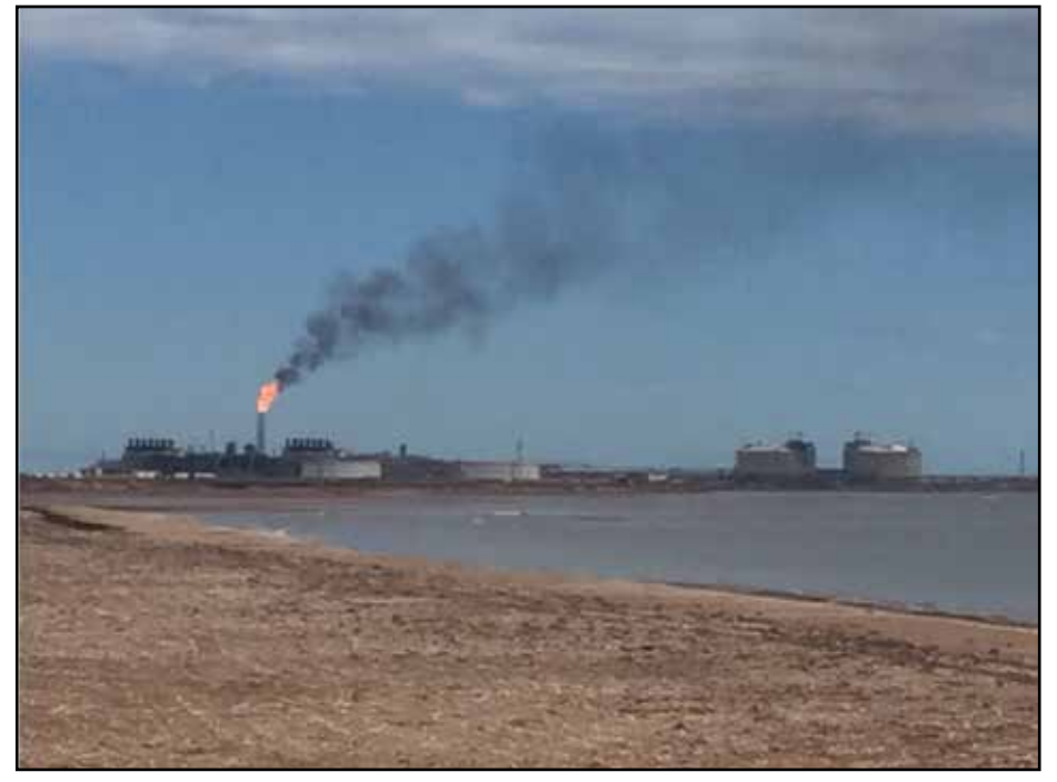
Chevron's Wheatstone liquid natural gas (LNG) project in the Pilbara.

ly significant in efforts to avoid further and more dangerous climate change.