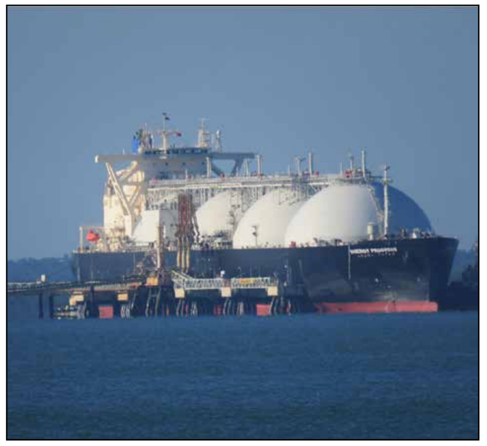
LNG tanker, Energy Progress, taking on cargo at Darwin LNG Terminal, Northern Territory.

• LNG export terminals are under development in 20 countries, of which Canada and the US account for 74% of proposed new capacity. If built, LNG terminals in pre-construction and