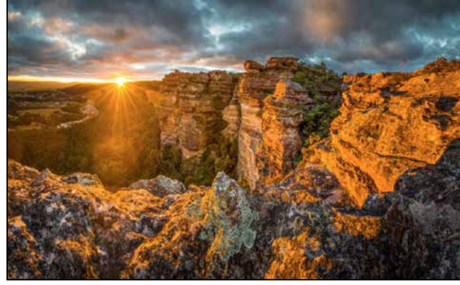
The Gardens of Stone National Park.

The global gas market will need to slow the pace of its growth, to avoid